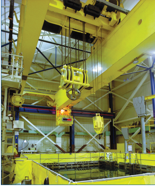
125 TON NUCLEAR FUEL HANDLING CRANE