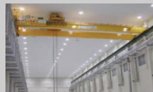
Industrial Double Girder Cranes