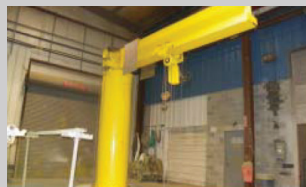
Free-Standing Jib Cranes