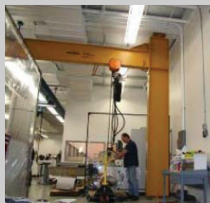
Mast Type Jib Cranes