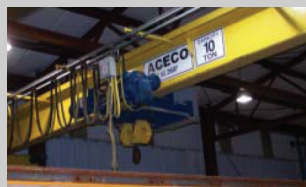
Industrial Single Girder Cranes