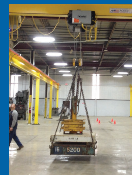
Interchangeable Stack Weights