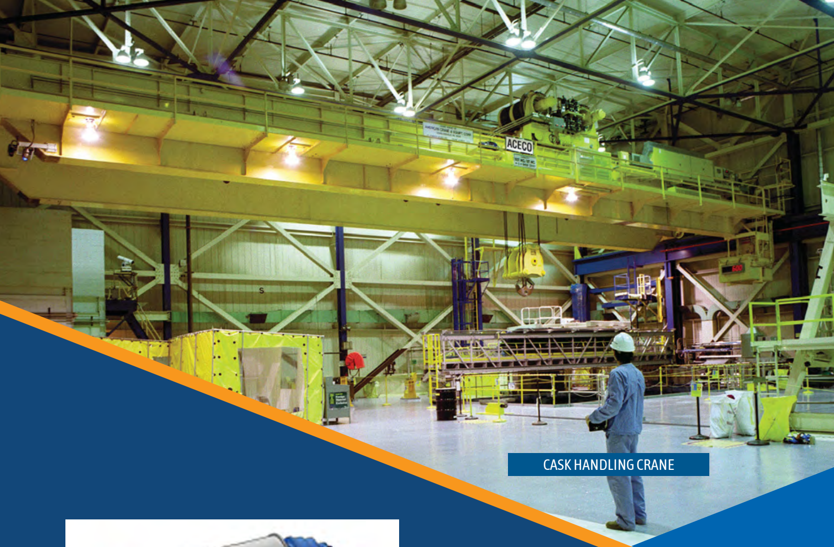
CASK HANDLING CRANE