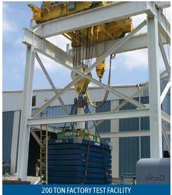
200 TON FACTORY TEST FACILITY